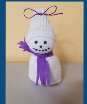
step 8-- finished!

Taken in part from thecountrychiccottage.net/sock-snowman-quick-easy-craft-idea/